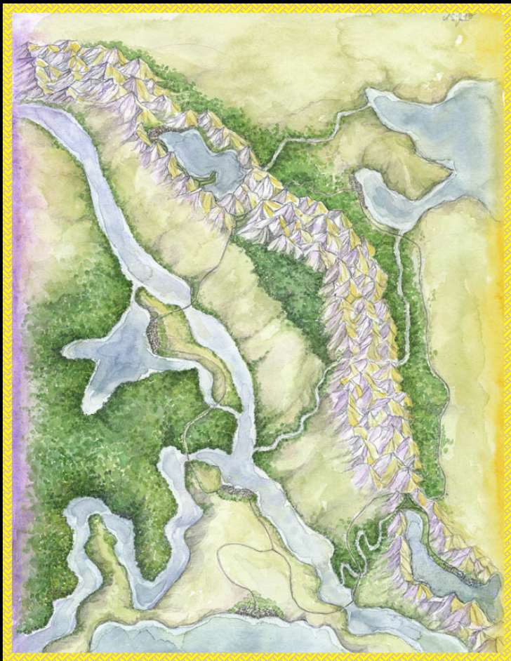
Image of an original watercolor by Anke Eissmann — 2010 Out of the Imagination and Mind's Eye of the Short Story Aficionado™

aBiToF MYSTERY, ROMANCE and ADVENTURE™ ©1997-2010 by GTTransGlobal™ — PACIFIC NW U.S.A.